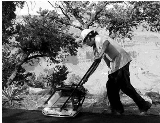
The Grand Canyon paving crew begins Phase 1 of the Greenway.

I mention this meeting as a lead into a brief article to describe the talented individuals of the dedicated MTC Engineering & Construction Committee. At last count there were 14 members of this important committee. Within this talented committee is an Information & Technology manager, four active professional engineers