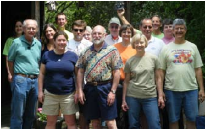
Peters Friends' group portrait from the annual picnic.