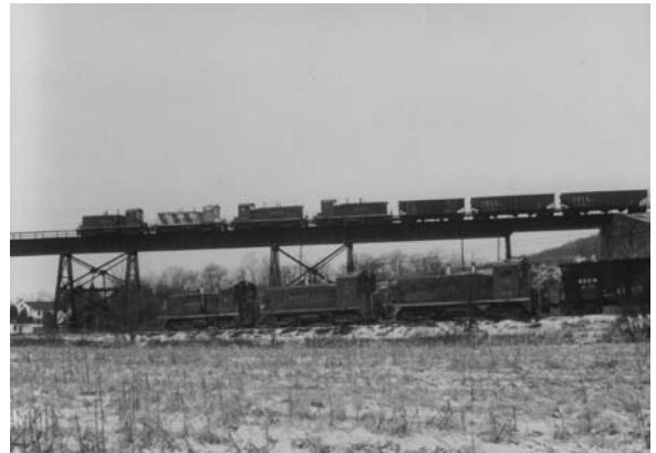
Empty hoppers cross McDonald Viaduct as a loaded coal train heads down the transfer track to deliver its cars to the interchange with the PRR Panhandle Division.

The eastern terminus of the Montour was at Mifflin Junction, in West Mifflin. The Union RR maintained a rail yard which also provided a connection with the Bessemer & Lake Erie RR. The Montour interchanged cars at Mifflin Junction, where they had a scale and local agent office to handle shipments. Countless Bessemer hoppers came onto and off of the Montour at Mifflin Junction, which was in use from 1914 until 1975.