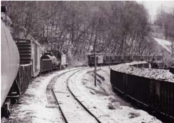
Engine 76 works the Hills Transfer track in Peters Township as it pulls non-coal freight from the PRR interchange. The empty hoppers and caboose sit on the main line, which is now the Montour Trail.

Near Baptist Road in Bethel Park (beyond trail's end) was the interchange at Salida with the P&WV (later N&W) RR. A siding there held 60 cars and was used for interchange with the P&WV or for storing cars that were on their way to or from Mifflin Junction. This track was last used in 1976.