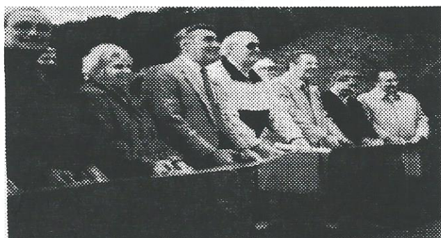
Officials from the local township and state governmental bodies assisted in cutting the ribbon marking the opening of the newest section.

An estimated 350 people came out on a crisp autumn day to attend the third opening ceremony to be conducted on the Montour Trail. The ceremony was held on Sunday, October 10 in a portion of Wickes Furniture's parking lot off Montour Run Road. Over five miles of additional trail became officially available to the public from the Parkway overpass northward along Montour Run to Groveton. Combined with the Findlay section, an unbroken 8 mile stretch of trail is now available for use.