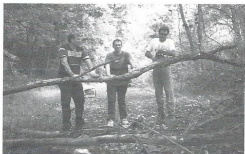
Volunteers from Bombardier Transportation help clear trees prior to construction work near Clairton during United Way's annual Day of Caring this past September.

Volunteers have installed most of the barrier posts and a gate at Clairton to keep cars off of the trail. In September, over 60 Bombardier Transportation volunteers did some post-construction tree trimming and trash pickup