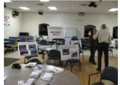
MarkWest Reps set up before the meeting.

The railroad will connect with the W&LE at Southview near the location where the Montour had a connection with W&LE forerunners Norfolk and Western, Pittsburgh & West Virginia Railway and the Wabash. It will then parallel the main line trail from near Galati Road to Gilmore Junction where it will then follow the Westland spur to Westland. A rail yard is to be constructed on the site of the old Westland Mine to store empty and filled tank cars with product from the plant. See page 6, Montour History to learn more about the Westland Branch.