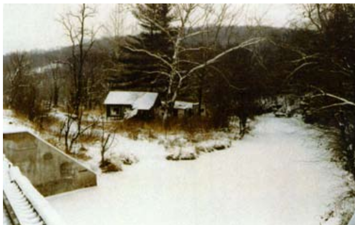
But in the early 1960s when the Montour Run "Expressway" was built the roads leading to the cottages were abandoned and they were left to decay.

But what a Shangri-La for them when they arrived! Eleven cottages - some built out of old railroad cars - a snack bar, a dance hall, and a nice cool creek in which to while-away the afternoon. Horses could be hired at one of the near-by farms.