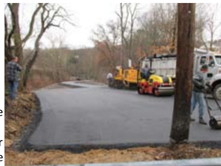
Triphammer Ramp and parking area being asphalt paved 12/17/2012 from Triphammer Road. Piney Fork Bridge in the background.

Volunteers finished laying the last 200 feet of millings on December 18, a drier but cooler day. Continue on page 3