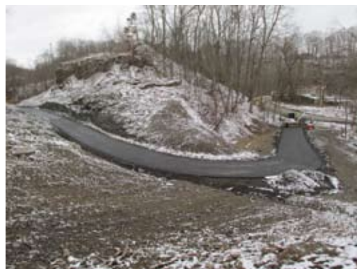
The Piney Fork Ramp between the original Montour Railroad alignment and Piney Fork Road on 12/22/2012. Ramp slope is approximately 4%.

At the end of 2012, Phase 8E2/8 is nearly complete, but the trail is not yet safe for trail users. The trail still needs signage, fences for the steep banks of the Tripphammer Ramp and a steep section of the Piney Fork Ramp. Additionally, the bridge at MP38.9