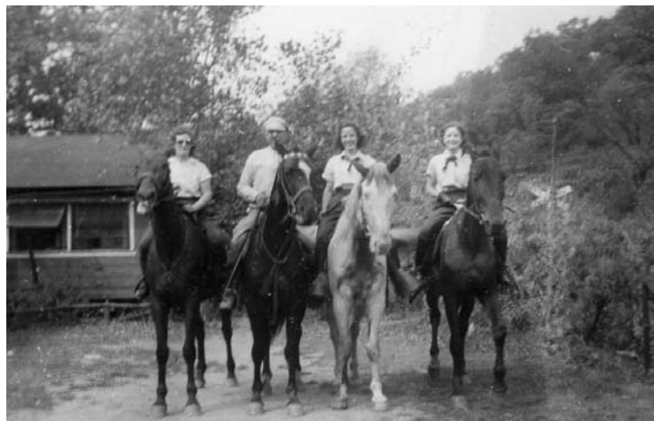
Montour Park- a Shangri La for city dwellers. Note the railroad crossing sign situated just before the Volunteer Bridge.

Our city travelers would have gone another quarter mile or so beyond that bridge to where the Connecting Road crossed the tracks just before the second of the three bridges (referred to as the "Volunteer Bridge" because it was constructed by MTC volunteers as opposed to the other two "Duquesne Light" bridges, so named because Duquesne Light needed them to place the poles that exist along that stretch of trail and built them to our specs, knowing that the trail would be built when they were finished.)