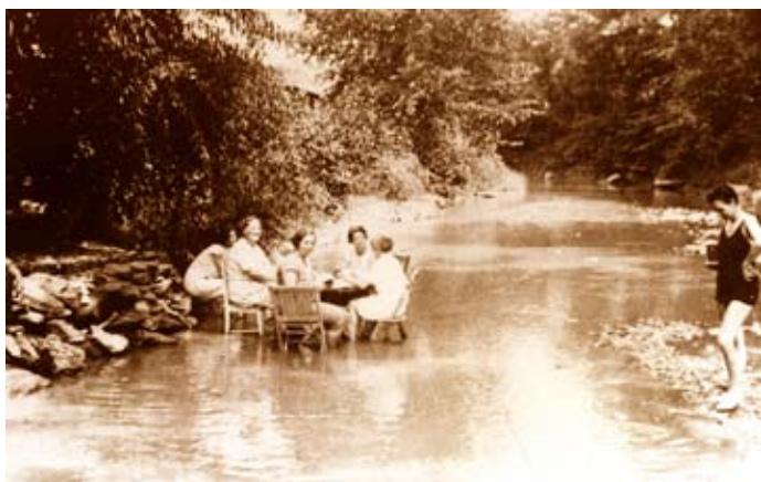
Playing cards in the cool waters of Montour Run Creek

Montour Run Road did not exist until the early 1960s, so to get there, they would have taken Montour Park Road which began right behind the current Universal Specialties (behind the fence on the left after you pass under the Beaver Grade Road overpass) and then on to the Beaver Grade - Cliff Mine Connecting Road. Both of these