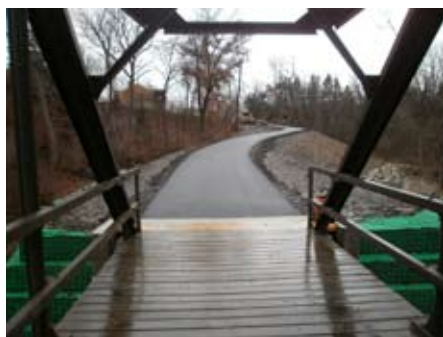
Triphammer Ramp from the Piney Fork Bridge at the completion of asphalt paving 12/17/2012.

Our last update on construction of the \frac{3}{4} mile of trail from Triphammer Road in South Park Township east to Piney Fork Road (MP38.2 to MP39.0) was in the July-August Trail-letter. At that time, the ramp from Triphammer Road to the Piney Fork Bridge was half built, and Mingo Creek Construction was the low bidder of a contract to build the western wingwalls of the Piney Fork Bridge, complete the Triphammer Ramp and excavate a ramp from the existing trail right of way to Piney Fork Road. Volunteers had finished most of the clearing and grubbing of the Piney Fork Ramp and were in the process of grading the 0.6 mile of trail between the Piney Fork Bridge at MP38.3 and the concrete bridge at MP38.9.