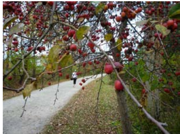
Photo Contest Winner - A Berry Nice Trail