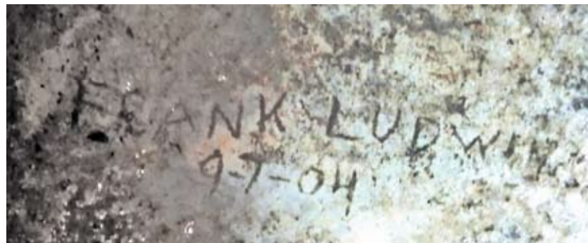
Frank's signature approving the concrete floor of the trail garage.