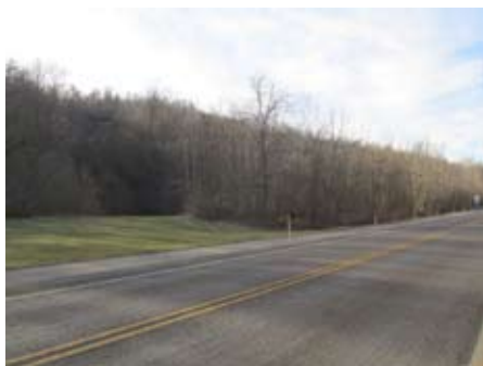
Photo of the Dowling property. The view is to the southwest along the frontage of the 2.7 acre Dowling property on Piney Fork Road. The sign at the far right is near the southwestern end of the property. The grassy area is a mowed pipeline right of way.

On December 29, 2014 the Montour Trail Council closed on the donation of the 2.7 acre Dowling property along the trail in Jefferson Hills Borough. The property fronts along 600 feet of existing trail near milepost 40.5, between Snowden and Gill Hall Roads and varies in depth from 150 to 200 feet between Piney Fork Road and Peters Creek. The property is wooded except for a grass covered gas line right of way running north south at the northeastern end of the property.