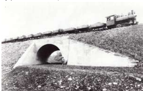
The concrete arch at Beagle Club Road was built in 1913 during construction of the of the Montour Railroad extension to West Mifflin. It is still in place today carrying the Montour Trail.

Concrete arches were used where the railroad would cross on a high fill above a roadway. These look more like a tunnel was dug under the railroad. The arches were typically 24 feet wide to accommodate a 2-lane road. Fill would be piled on top of the arch and then ballast and rails laid in the same manner as on flat ground. Often, when travelling over these bridges, trail users might not be aware that they are actually crossing a bridge, unless they would see a roadway going underneath the trail. It looks very similar to places where the trail (nee-railroad) runs on a raised dirt fill. Examples include Santiago Road near Imperial, Beagle Club and Donaldson Roads near Champion, Primrose Road near McDonald, and Southview Road and the adjacent Miller's Run bridge. Several of the arch bridges were removed due to traffic safety issues where visual clearance was blocked and cars could not see oncoming traffic, or to provide access for large trucks which could not fit through the old arches. Some were replaced with new, longer trail bridges like those on Muse-Bishop Road in Cecil Township and at Bebout and Sugar Camp Roads in Peters. Approaches were re-graded to provide safer sight lines and the new trail bridges, which replace a 24 foot wide arch, each of which exceed 100 feet. The concrete and fill removed at several of these bridge replacement projects was re-cycled and used as fill at other Montour Trail project locations.