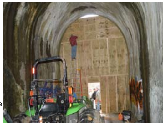
Volunteers install the plywood panels on the interior of the west portal.

Adding one final personal note, on December 8, while the volunteers were installing the east panels, a cyclist rode up to the tunnel and asked this writer what we were doing. I explained to her that we expected the doors to reduce airflow through the tunnel and therefore reduce ice buildup. Her comment was, "Sounds like wishful thinking to me". However, it should be clear that the use of the doors was not wishful thinking, but carefully considered, and that the examples of Big Savage Tunnel and other sources made it clear that stopping air flow through the tunnel would create above freezing temperatures in the tunnel and prevent ice buildup. This writer, before he retired had collected temperature data from coal mines (for an entirely different reason) showing the contrast in the winter air mine shaft temperatures and temperatures just a few inches into a mine roof. So far our confidence appears vindicated, to the benefit of our trail users.