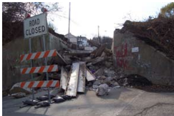
The bridge at Cowden Road in Cecil Township used steel I-beams encased in concrete. This narrow underpass was completely demolished and re-graded in 2002, with the trail currently using an at-grade crossing of the road.

Concrete beam bridges were used over roadways, streams and as other medium length bridges. Some were made of pre-stressed concrete beams and some used steel I-beams encased in concrete. Locations for these type of bridges include two of the bridges crossing Montour Run near Enlow Tunnel, at Cowden Road in Cecil and at the water company along Brownsville Road in South Park. Most of these had ballast rock placed on the concrete deck and then ties and rails laid on the ballast, instead of using the timber decking style that was prominent on the steel girder bridges.