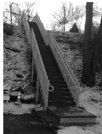
Bebout / Valley Brook Road stairway.