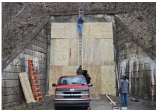
Volunteers install the plywood panels on the exterior of the west portal.