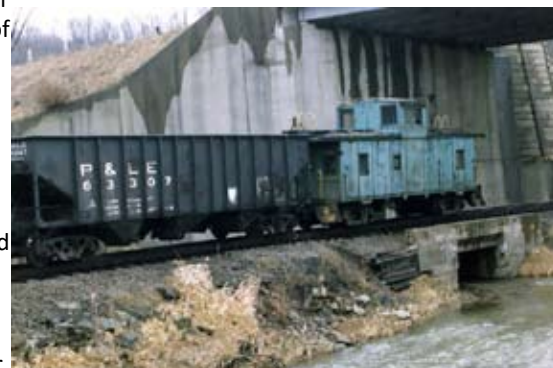
This short concrete slab bridge seen under the caboose crosses a stream flowing into Montour Run next to Beaver Grade Road.