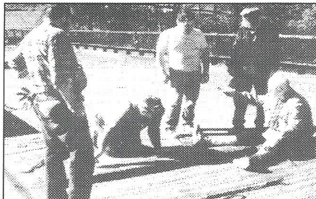
The Cecil Friends as they prepare to fill some major cavities on the Johnston Rd. Hy-level Bridge.