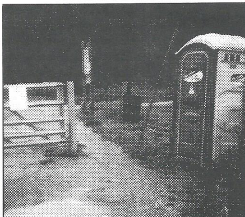
Due to popular demand, porta-potties have been installed at various locations along the Trail until the end of October.

Unfortunately, there are no foundation grants for porta-potties. These funds must come from our general operating budget that relies primarily on the dues of the members of