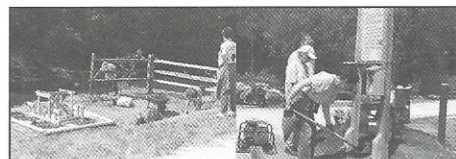
Above & below pictures feature Deloitte Consulting employees enhancing Trail access area at mile 3.1. At center right, Sto-Rox students create colorful rails-to-trails mural.

Please visit "Deloitte Park" if you are in the area. It's worth the effort!