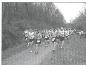
Burgh's 10K runners on the Cecil section of the Montour Trail.