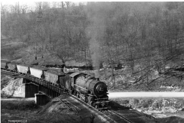
A loaded coal train crosses the bridge over Valley Brook Road and Brush Run in 1952.

A realignment project was undertaken to straighten and add several new bridges on Valley Brook Road in 1985-86. The old railroad bridge was removed during this project and the east concrete abutment and the center pier were also removed as the roadway was straightened. The west abutment was left in place, as it did not interfere with the new road alignment. The portion of the trail from the Peters Sanitation plant west to the Cecil Township line at Chartiers Creek went unused for another 20 years.