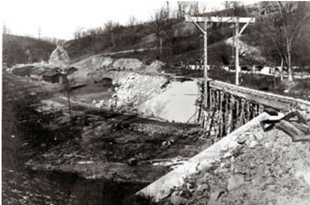
A temporary wooden trestle waits for the steel girders needed to complete the bridge in 1914. Valley Brook Road is just a dirt path as it curves in front of the then new west abutment.

Built a little over a century ago, in 1913-14, it was known as East End Hills and carried the railroad over Valley Brook Road and Brush Run. It was 110 feet long, consisting of 2 deck plate girder spans of 80 and 30 feet. This deck plate girder bridge had two large rectangular steel girders fabricated of welded plates, making up each span. They were spaced so that the railroad rails would be located above each of the two girders. A timber deck was laid on top of the girders and the rails were laid on top of the timbers. A safety walkway was installed along one edge of the bridge.