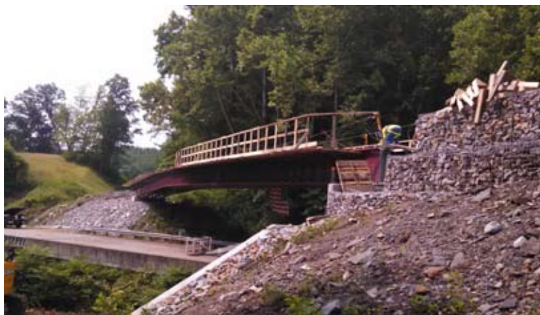
Installing temporary railings and scaffolding on Valley Brook Bridge #2, July 2, 2015 in preparation for pouring the concrete deck.

During the period the road was closed, trail users shared in the temporary inconvenience of motorists, having to navigate a steep 0.58-mile detour through trail neighbor Tom Robinson's property. Along with his opening up his property for temporary trail parking during bridge construction, Tom's generosity in allowing trail detours through his property has helped keep the inconvenience level for trail users to a minimum.