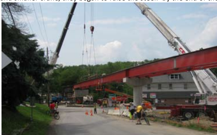
The first beam is set in place over PA 50 on the final day of steel erection.

A week after the final beam was set at VB2, CH&D was ready to set their beams at the 980-50 flyover. On Tuesday, the original span was returned to its modified abutment and pier. Century Steel Erectors as the subcontractor for CH&D to erect the steel. Several of the beams for the new superstructure were delivered that evening as well. On Wednesday, with the use of a second and smaller crane, they began to raise the steel. By the end of the workday, they had three beams