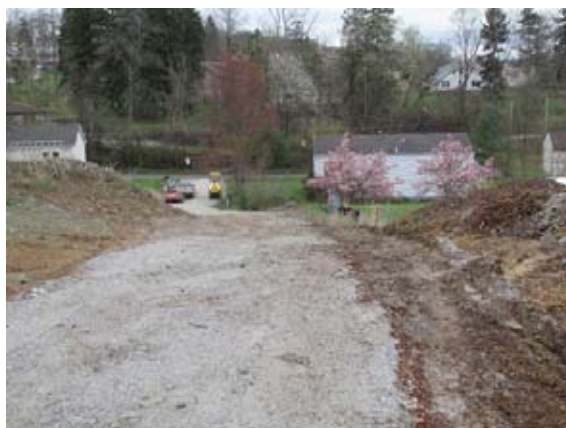
Left: Looking toward Pleasant Street from the top of the hump. When construction is completed this location will be 16 feet lower and no longer be the high point.

http://groups.yahoo.com/neo/groups/Montour-Trail/info