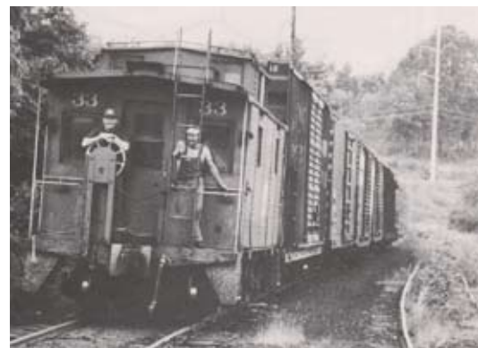
A train from Brookside Lumber backs through the east leg of the wye track. It will then pull out on the west leg of the wye with the locomotive leading the train. The storage siding can be seen to the right of the train.

Although the Library Branch was taken out of service in mid-1978, and main line operations in Bethel Park ended in 1976, the junction and the wye track were used until operations to Brookside Lumber ended in December, 1980.