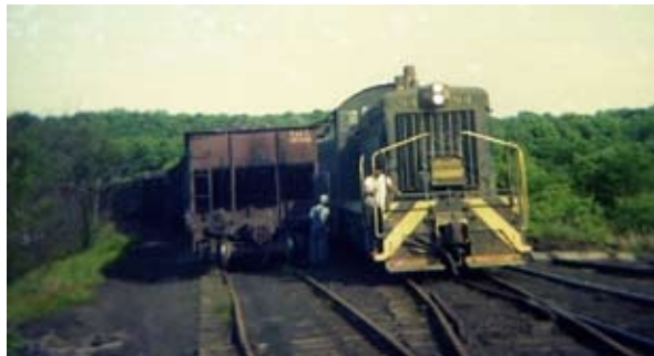
Loaded hoppers have been pushed up the hill from Mine #10 onto the siding. The train crew is now using a cross-over switch to run around the cars and couple onto the front of the train.

Library Junction is located between Sugar Camp and Brush Run Roads in Peters Township at Trail Mile 34. The Library Branch was built in 1918 to serve Montour Mine #10 in Library. In 1929, the branch was extended three miles to an interchange point with the B&O RR at Snowden in South Park.