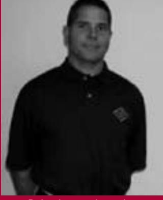
Polo shirt with pocket

Here's just a taste of what we have to offer!