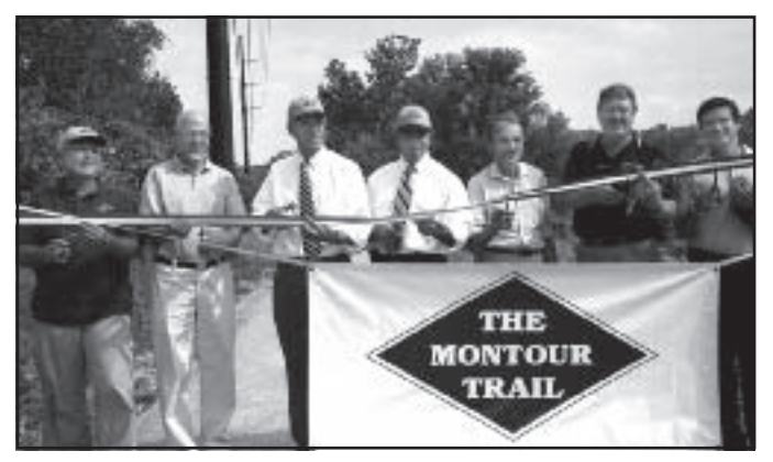
On September 16, the Council celebrated the reopening of miles 0 to 10 that were almost completely destroyed by Hurricane Ivan in 2004.

Thanks to all who make the Montour Trail possible! If you or someone you know has been inadvertently omitted from the following list of 2005 contributors, please contact us.