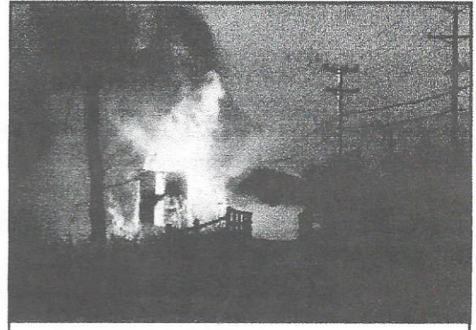
Picture shows close proximity of Trail to the building being burned.