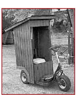
You won't need to ride the trail on this if you read the portapotty article on Page 2.