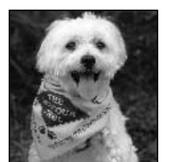
Bring Fido or FiFi down to the trail for a good time raising money to support the Montour Trail.

Visit the Montour Trail web-site at: www.montourtrail.org