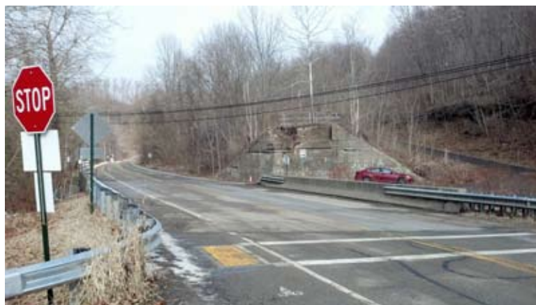
The location of the Valley Brook 2 Bridge adjacent to the current at-grade-crossing.

The second part of a two-phase project, to more safely connect the Montour Trail in Peters Township to the Arrowhead Trail section, is approaching the starting gate. As this article is being written, the final touches are being put on a Valley Brook Bridge #2 bid package by WEC