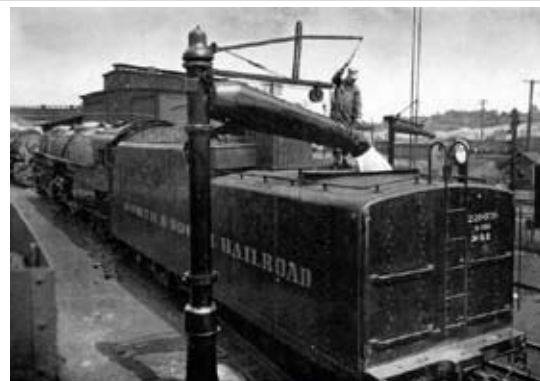
Water columns similar to this one were used at several Montour locations rather than the more traditional tank spouts.

You can contact the Montour Railroad Yahoo group at http://finance.groups.yahoo.com/group/montour_rr/ There are currently 331 members from across the country. You are encouraged to join. There is a wealth of information about the Montour Railroad at this location and you can pose questions of its membership, from whom you are sure to get an answer. There is also much information at http://www.montourrr.com