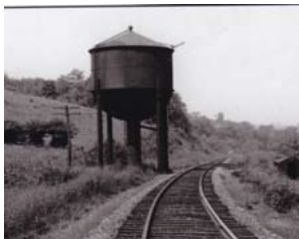
Fife water tank stood along the main line in Peters Township. Concrete footers for the legs and center column can be found at the edge of the Trail at Mile 31.5.

Champion (Trail mile 12.5): Locomotives working the Champion preparation plant needed water while they switched the plant. A water column using the plant's water supply was available at the loading tippie.