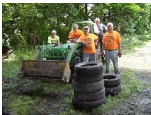
Airport Friends at work on the Coraopolis Extension.

The MTC has a volunteer heavy equipment construction unit headed by Bill Capp that operates out of the central maintenance building in Cecil Township. The more routine maintenance is expertly completed by our quiet, hard-working and very friendly six Friends groups.