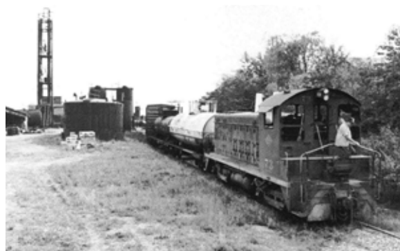
In June, 1980, Montour #73 pulls cars from Chemicals & Solvents Company in Muse.

After the mine was closed, a chemical reclamation company leased some of the mine buildings and land until the Montour Railroad stopped servicing the site in 1982. When railroad operations ended, a train of 82 surplus box cars from the Pittsburgh & Lake Erie RR was stored on the Muse Branch from April, 1982 to September, 1983. Official abandonment of the branch was approved in 1983, the stored cars were removed and the rails were pulled up.