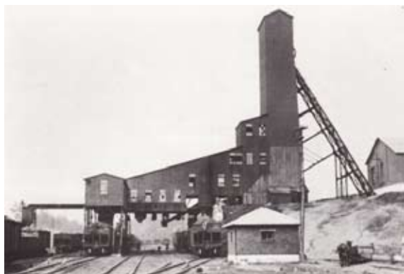
Loading tippel at National Mine No. 3 in Muse, PA.

The National Mining Company, a subsidiary of United States Steel, opened its National No. 1 mine near Bridgeville in the early 1900's. As the mine advanced westward, additional mine portals were opened to reduce the distance coal had to be hauled before being brought to the surface for shipping. National No. 2 was opened in Cecil Township, with records showing it operating as early as 1905.