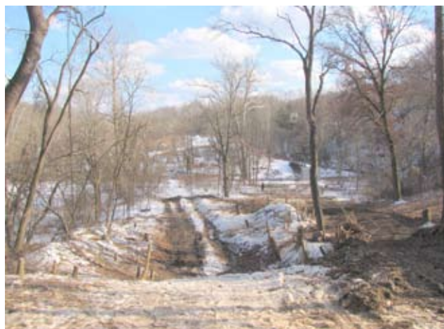
.....the scene after.

Eight members of the South Hills Friends of the Montour Trail were joined by six other Montour Trail volunteers, two employees of Mingo Creek Construction and a trail neighbor, a total of 17 workers. The work party began at 9:00 a.m. and eleven volunteers were still at it to the finish at 4:00 p.m. They were assisted by two critical pieces of equipment donated by Mingo Creek Construction; a chipper and, most importantly, a track mounted skid loader. Volunteers used chain saws to down trees and cut them to length and then stacked the logs and branches for the skid loader. The skid loader used a thumb attachment to pick up and haul the logs and slash to the chipper at the top of the ramp. The logs were then cut up by volunteers to provide future firewood and the branches fed to the chipper to compact their volume. Roughly 20 trees between 3 and 6 inches in diameter and another dozen between 6 and 20 inches in diameter were removed, with many smaller saplings knocked down by the skid loader. By the end of the day the chipper had produced a pile of chips and sawdust nearly six feet high, and there was an even higher pile of logs. The skid loader, using its bucket, also dug a temporary road which will be used to extend the drain pipes. After the site was cleared, volunteers laid out the ramp centerline and marked the edges of the ramp to make future planning of the project easier.