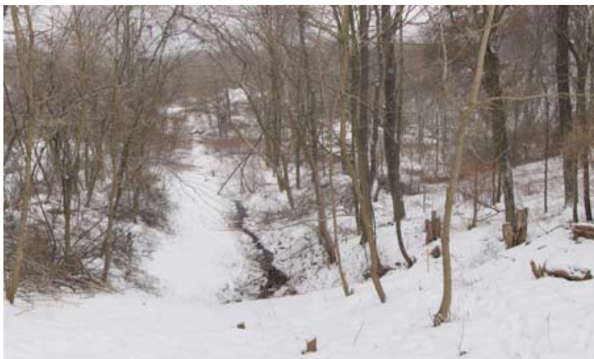
The Scene before.....