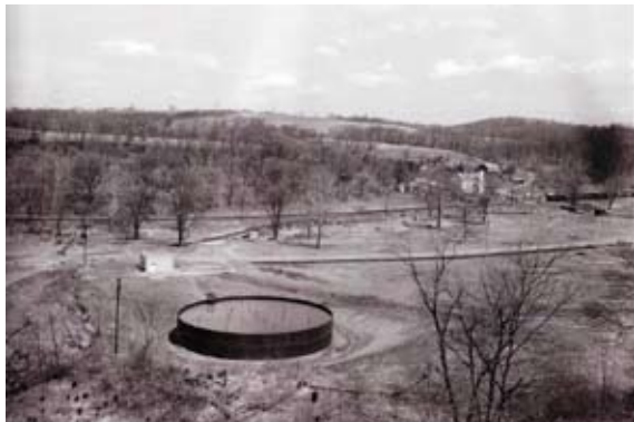
Looking north from the Parkway West hillside in 1962, Scott farm can be seen across the valley. At the right edge of the photo, coal hoppers sit on Scott Siding at the Scott Road crossing.

In 1920, the mine was taken over by the Camden Coal company and renamed Scott Mine. In 1931, operation of Scott Mine was taken over by the Montour Collieries Company. The mine operated for several more years, closing in the mid 1930's.