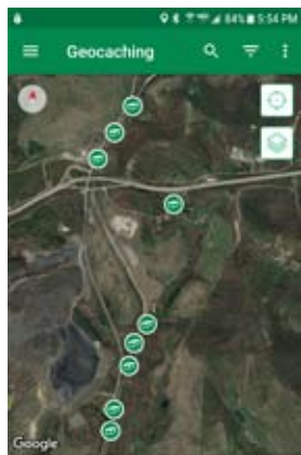
Screenshot of app showing trail near MP 11

A traditional geocache is a waterproof container (like an ammo box, coffee can, or Tupperware) that contains a few small trinkets and a log book. The cache owner hides it somewhere in the outdoors, and then posts the location and description to the geocaching website ( www.geocaching.com ). Cache seekers then use a free smartphone app to identify nearby caches. When you find a cache, you can sign the log book and record your find in the app. You can also take one of the trinkets from the box, as long as you leave something behind for the next geocacher. Geocaches may not be buried, but they can still be tricky to find. They may be hung in trees, nestled in hollow logs, tucked among rocks, or tied to poles or fences.