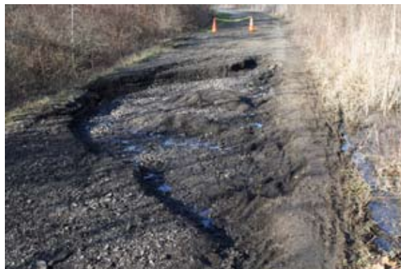
Washout west of Enlow Tunnel. Fixed by first day of spring.

The trail erosions at Cliff Mine and Enlow should be repaired before the newsletter is mailed. The stream bank erosion will need to have some engineering and permit requests.