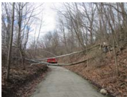
Two sycamores cut down near the Stewart Road trailhead, 3/2/18.

http://groups.yahoo.com/neo/groups/Montour-Trail/info