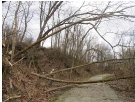
A group of leaning trees being cut down on 3/2/18.

So, the Friends January, February and March work parties were all planned around removal of trees in that area. However, the weather refused to cooperate and the work parties ended up doing little of the tree removal. The January work party was cancelled