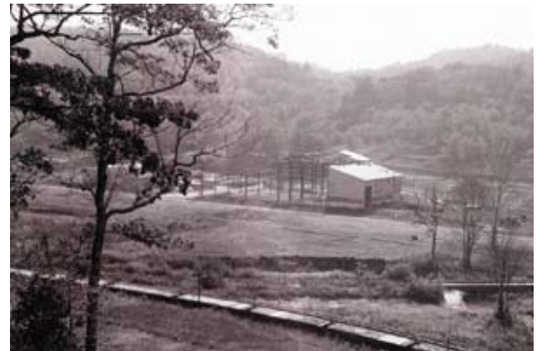
In 1964, Richlyn Machinery is under construction in the Nelson Industries park. Surplus flat cars are stored on Scott Siding beside Montour Run Road. This view is looking south from the hillside near the current K-Mart.

The Montour rails were pulled up in 1986, but the rails leading into the industrial park were owned by Nelson Industries and were left in place. Over the years, they have been pulled up for scrap but several buildings and parking lots still have remnants of rails evident in the pavement and the steel bridge over Montour Run remains as an abandoned piece of the railroad.