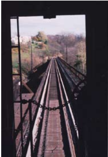
A view out the door of a Montour caboose leading a train across the viaduct in 1975 shows the safety walkway on the right side.

One of the signature sights on the Montour Railroad and the current trail is the Library Viaduct, which is now a century old. At 506 feet, it was the second longest bridge on the railroad. Only the McDonald Viaduct was longer.