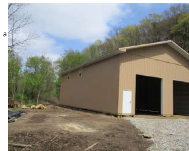
This is how the garage looked on 4/29 with the outside structural work completed.