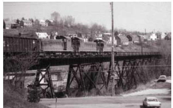
This 1973 view shows Montour locomotives shoving a coal train over the viaduct. Houses along Helen Street are in the background.

The Montour Trail Council acquired the railroad right-of-way and started planning for its rehabilitation to open this missing segment along the Library section of the trail. The detour along Rt. 88 and Brownsville Road was a dangerous transition to reach the continuation of the trail near Stewart Road. Work was started in the spring of 2014 as trail volunteers cleared out the brush and trees growing under the bridge and contractors started dismantling the rails and timber bridge deck. A new concrete deck was poured, guard rails and fencing added and the bridge was opened to trail traffic in April, 2015. Additional construction was needed along the trail segment connecting the viaduct with Pleasant Street, with completion and the official trail dedication of the viaduct and trail segment occurring in the spring of 2017.