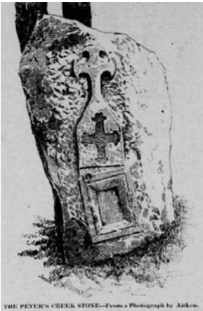
THE PETERS CREEK STONE

The late 1800s was a busy period in transportation development along the Monongahela River. The Pittsburgh, Virginia and Charleston Railway was built along the west bank of the Monongahela River with a terminus at Monongahela City in 1873.