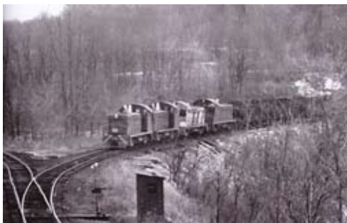
A railroad telephone booth sits beside the west switch at North Star Junction.

As traffic on the Montour Railroad increased in the early 1900's, a method for the train crews to contact the dispatcher at Montour Junction while they were working out on the main line was needed. Written orders picked up at the dispatcher's office at the beginning of a shift would often become outdated before a train finished its run, as other trains were also working on the single track main line. The telegraph system then in use for communications had a limited number of receiving locations.