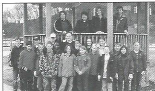
Robinson Twp. Christian School students, teacher and parents.