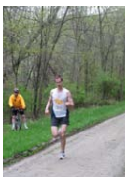
5K Men's winner comes home.