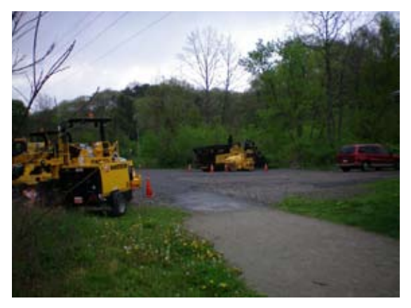
Cliff Mine Parking looking West.

Steubenville Pike-Enlow Road is reconstructed. The work included clearing and grubbing to construct a new driveway entrance to Cliff Mine Road. It will be located on property acquired October, 2009 from the Jean M. Perun Living Trust. Being located 200 feet from the intersection, it will provide a safer location to replace the existing entrance that will be closed. The new driveway entrance includes a pipe culvert to continue drainage flow along Cliff Mine Road.