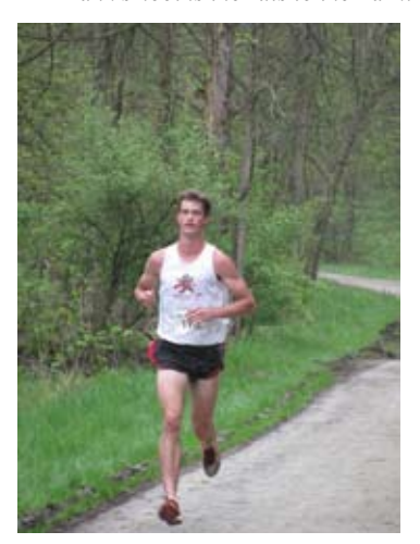
10K Men's winner finishes.