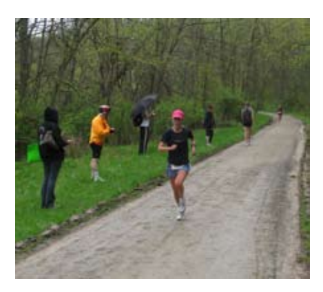
5K Women's winner finishes.