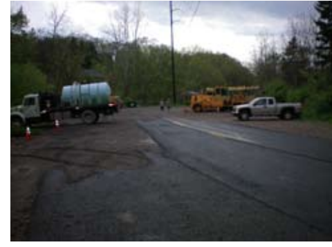
Cliff Mine Parking looking East