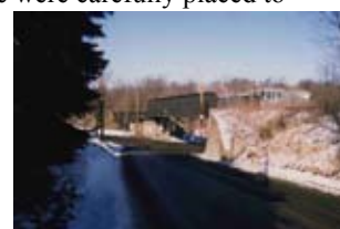
The Venice Railroad Bridge in January 1996.

The Montour Trail had been completed to Cecil Park in 1992, to Venice in 2001, and from the north side of Route 50 to McDonald in 2003. That left a half-mile gap along very busy Route 50, and its treacherous intersection with Route 980. Trail users, those with enough determination to travel through, had to jump into the stream of fast-moving cars and trucks, stay calm, pedal hard and straight, and make a left turn in traffic to get through the gap. (continues on page 4)