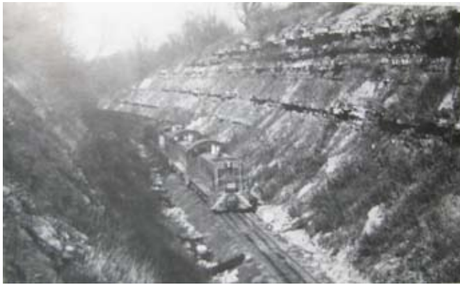
A 1979 view shows a train in Peacock Cut. Originally bored as a tunnel, it was daylighted around 1918.

The first tunnel, at Trail mile 7.2, was actually the last one built and was known by two different names. The railroaders called it Jeffreytown for the settlement at the eastern portal, but it is also known as Enlow Tunnel, for the town located to the west. It was built in 1926 as part of a realignment project that eliminated several sharp curves on the Montour's main line. The original railroad followed Montour Run as it looped around the hillside. The tunnel eliminated about a half-mile of track and some sharp curves by burrowing under the hill for 575 feet. This tunnel is the only straight bore on the Montour.