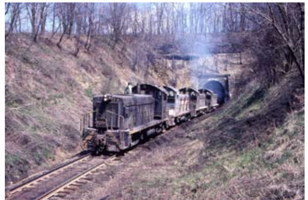
Aaaah – fresh air. A train exits National tunnel, trailing a cloud of diesel exhaust.

The final tunnel was bored through the ridge above Chartiers Creek at Trail mile 28.6. It also has a curved bore and was the shortest on the line at 235 feet. As with the others, it had a wood liner until concrete was added in 1922. A nearby tunnel had been previously bored through this ridge to carry the Pennsylvania Railroad and was called Bell Tunnel after the landowners of this area. Needing a different name, the Montour called their tunnel Greer, for another nearby landowner. The railroad now operating through Bell Tunnel actually calls their tunnel "Greer", as did some old topographic maps – a misnomer that adds to our tale. This is a tunnel with only one name, but seemingly with two locations.