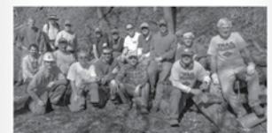
Volunteer work party along the Trail

Joining the Montour Trail Council helps to support a great community resource.