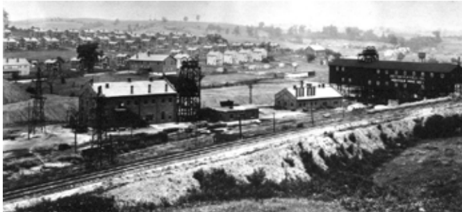
Montour Mine #1 at Southview, circa 1927. Gene P. Schaeffer collection.

The other two PCCo mines were Montour #2 at Cowden – trail mile 23 - and Montour #4 at Hills Station – trail mile 30. Several mines owned by other companies were also opened as the railroad was extended from Imperial to Bethel Park and West Mifflin.