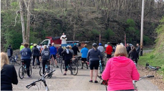
The Blessing of the bikes.