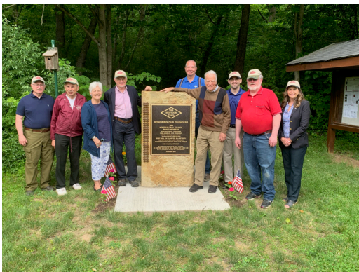
The Dedication of the Founding Father Monument