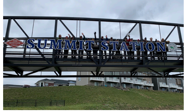
Summit Station Bridge.