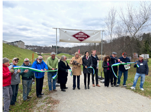
Summit Station Ribbon Cutting