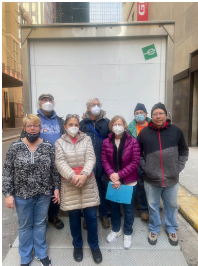
The GNC Crew gathering donations