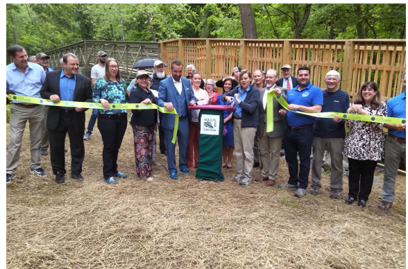
Holt Bridge ribbon cutting at Montour Run near Hassam Road.