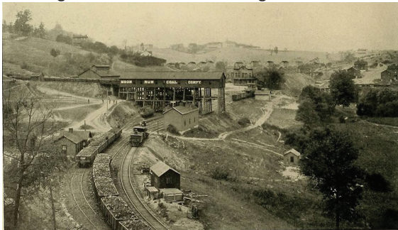
A view of the Moon Run Mine complex before 1900, with the passenger station to the left of the tracks and the company store and miners' homes beyond the tippie.

The Moon Run Mine was a drift mine, meaning its tunnels went directly into the coal seam outcropping on the hillside and no vertical shafts were needed. The Moon Run Mine eventually became a huge complex, extending southward as far as Carnegie and Rennerdale, northwest beneath Settlers Cabin Park and Robinson Town Center and eastward to the bluffs overlooking Chartiers Creek beyond McKees Rocks Road. The mine had three sections, with the main tippie just below Route 60. There was also a tippie on the north side of Route 60 above Chartiers Creek and another tippie on Campbell's Run Road about a half-mile west of the I-79/I-376 interchange. Piles of waste slate and rock can still be seen to the north of Rt. 60 and Moon Run Road.