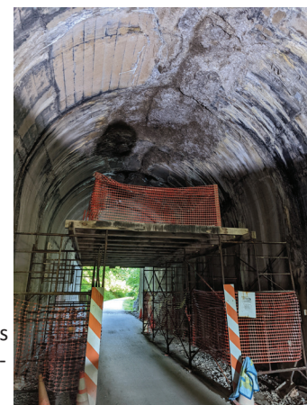
The Greer Tunnel temporary safety features.

Please visit www.montourtrail.org for updates and full closure schedule. Thank you for your patience as we work to maintain and improve the safety of our trail.