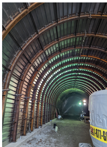
The tunnel lining system at the East Brady tunnel.

Work to repair the Greer Tunnel will begin June 2023 and extend through the fall season. The Greer Tunnel is located in Peters Township at Mile Post 28.7. Originally built by the Montour Railroad in 1913, the tunnel extended access from North Star to Mifflin Junction. Over the years the concrete ceiling has deteriorated and has required the installation of scaffolding to protect trail users. See page 4.