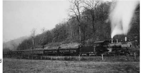
A loaded coal train descending the P&MR, after the 1912 merger with the Montour RR.

In 1899 the Moon Run Mine and the P&MR RR were purchased by the newly formed Pittsburgh Coal Company, along with the Montour RR and many other coal mines in Western Pennsylvania. The Coal Company operated the railroads as separate subsidiaries, as the P&MR continued to operate using its 2 locomotives and its steel gondolas for coal loading. Those cars were marked with P&MR RR reporting marks. In 1912, the P&MR was merged into the Montour. After the merger, new cars with Montour markings were used on the P&MR. There was no direct connection between the P&MR and Montour. The P&MR connected with the Pittsburgh & Lake Erie Railroad, then about a half-mile away the P&LE made another connection with the