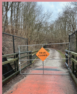
East portal from the railroad overpass.