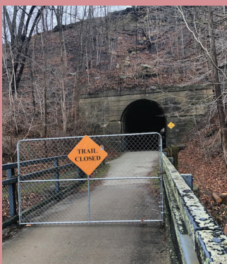
West portal from Chartiers Creek

The Greer Tunnel located at mp 28.6 (near Chartiers Creek Bridge) will be closed indefinitely as of March 23. The closure is because of a structural issue that was discovered March 22. The Trail regrets this inconvenience but user safety is our highest priority.