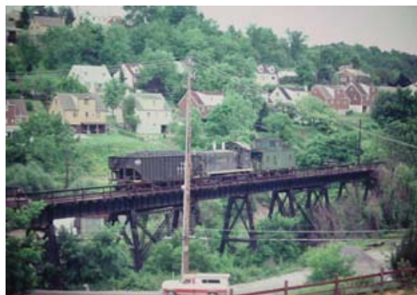
June 30, 1978. This small train consisting of engine #80 with caboose #36 and a single coal hopper was the last Montour Railroad movement over the Library Viaduct.

The Montour Railroad abandoned the Library Branch and thus the Library Viaduct when Montour #10 was permanently closed in late 1978.