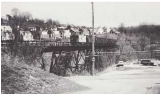
This 1973 view shows three Montour locomotives shoving a coal train over the viaduct.

The Library Viaduct was one of the signature sights on the Montour Railroad. At 506 feet, it was the second longest bridge on the railroad. Only the McDonald Viaduct was longer.