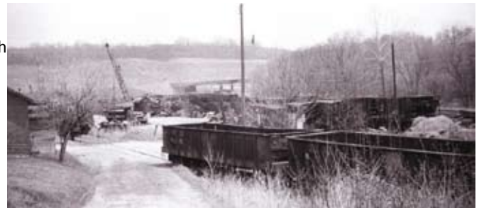
This 1956 view shows the yard at B&T. Two office buildings now occupy this site.

Briggs & Turivas generated a lot of non-coal traffic on the Montour Railroad, with cars and equipment coming and going in both directions to the interchange points with other railroads. It fueled the interest of rail fans and of modelers alike, as any type of car from any railroad might be seen on the Montour at B&T.