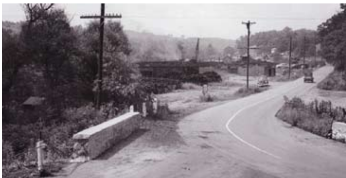
Looking south along Cliff Mine Road in 1947.

B&T also purchased some equipment from the Montour Railroad. When Montour operations ceased in the 1980's, B&T purchased the X1 crane from the railroad and sent it to Dennison, where it worked for another 10 years, until a main engine failure ended its useful life. Upon its later donation to the Montour Railroad Historical Society, the X1 was moved back to its home territory, where it is undergoing cosmetic restoration at Trail Mile 30.