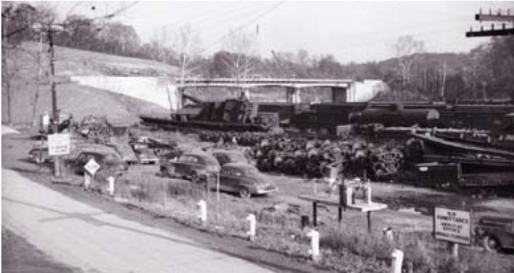
The Briggs & Turivas yard is filled with rail cars and recovered parts in 1948. In the background, construction is taking place on the Parkway West.

One of the interesting industries serviced by the Montour Railroad was Briggs & Turivas. B&T, as it was known, was located along Cliff Mine Road, just off the Parkway West. There are now two office tower buildings located at the site, at Mile 5.2 on the Trail.